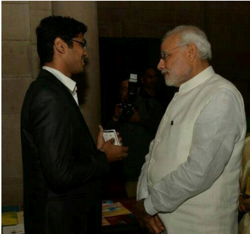
PM Narendra Modi meet at the President House, India