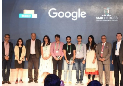
Google SMB Heroes, Singapore