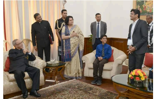
The President Innovation Scholar Award