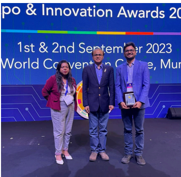
Winner- Global Digital Health Innovation Award