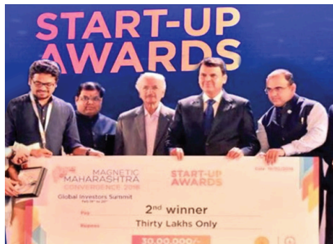
Magnetic Maharashtra, Award