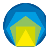
WORLD HEALTH SUMMIT Berlin